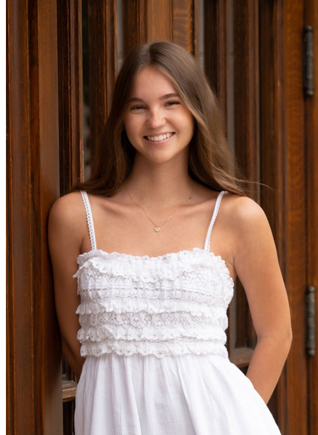
Grace Darke Oak House | St. Vincent de Paul Service Society

Service at Father Ryan means reaching out to vulnerable parts of our community and helping them in any way we can. For me, this means volunteering at Room In The Inn, Relay for Life, Safe Haven, and more. In every experience, you form relationships with people – some of whom you would never have made without that service opportunity. I played a major role at Room In The Inn at Christ the King, and it grew my relationships with many other students and the guests we served. It developed my compassion for those around me and taught me the importance of helping those in need.