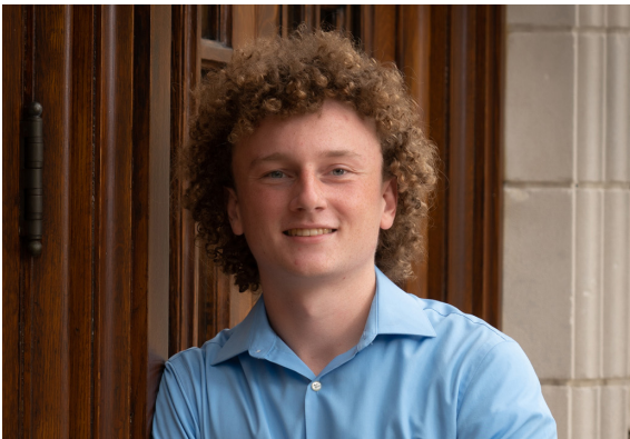
Brody Moran Elliston House | University of Tennessee, Knoxville